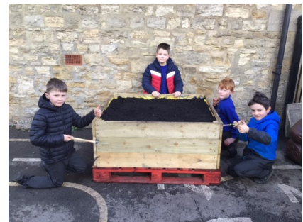
Building the Veg Box...

Next half term the Environment Ambassadors will choose the best of the plans and we will begin planting. Hopefully by the summer term and judging day we will have a box fit to win a day out at the Yorkshire show.